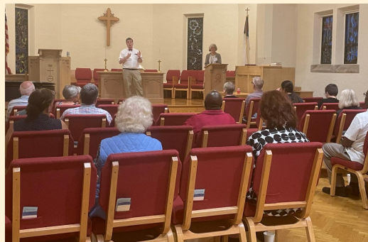
2CC hosted the UCC Fairfield County West meeting on Monday

Second Congregational Church | 139 East Putnam Avenue, Greenwich, CT 06830