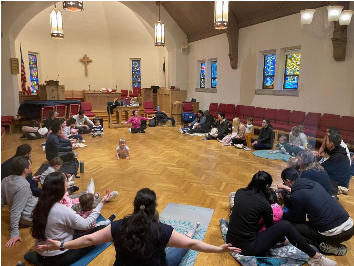
Everyone had a great time at the Music Together class on Sunday morning before worship!