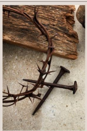
Good Friday 7:00 p.m.