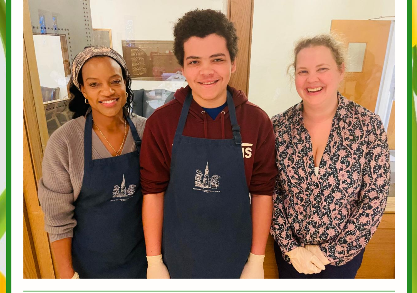
Good Friday VBS...