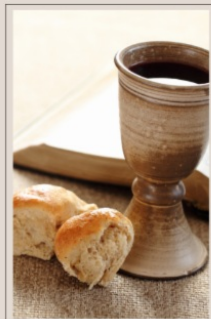
Maundy Thursday March 28 Meal at 6:15 p.m. Tenebrae Service at 7:00 p.m.