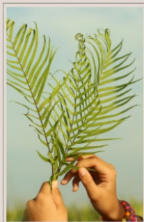
Palm Sunday March 24 8:30 & 10:30 a.m. Children's Palm Processional at 10:30 a.m. service