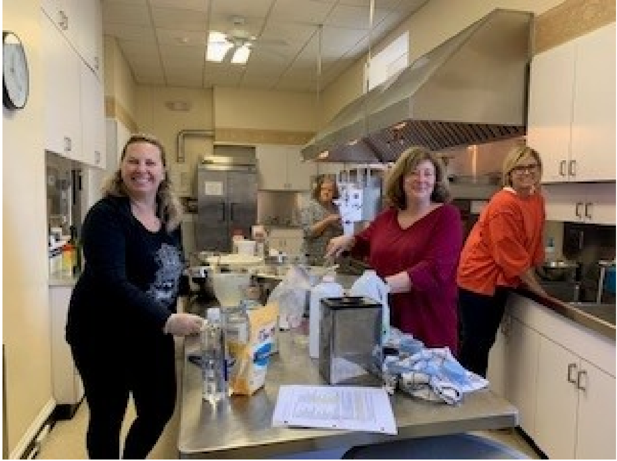
It's always fun in Children's Chapel!