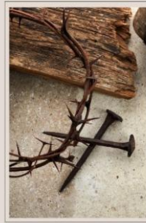
Good Friday April 7 7:00 p.m.