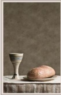
Maundy Thursday April 6 Meal at 6:15 p.m. Tenebrae Service at 7:00 p.m.