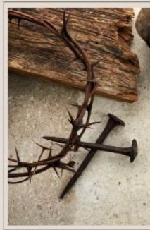
Good Friday April 7 TBA