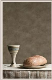
Maundy Thursday April 6 Meal at 6:15 p.m. Tenebrae Service at 7:00 p.m.