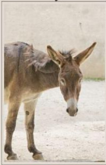
Palm Sunday April 2 8:30 & 10:30 a.m.