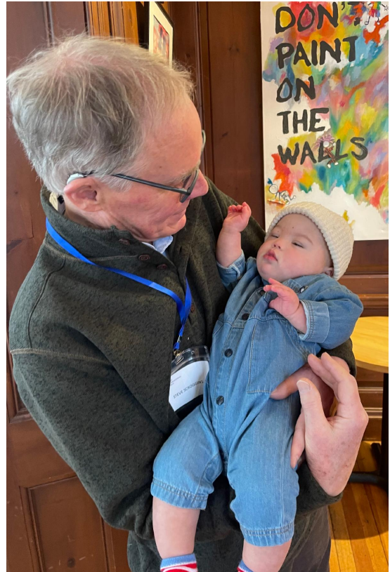
Busy morning at Children's Chapel...