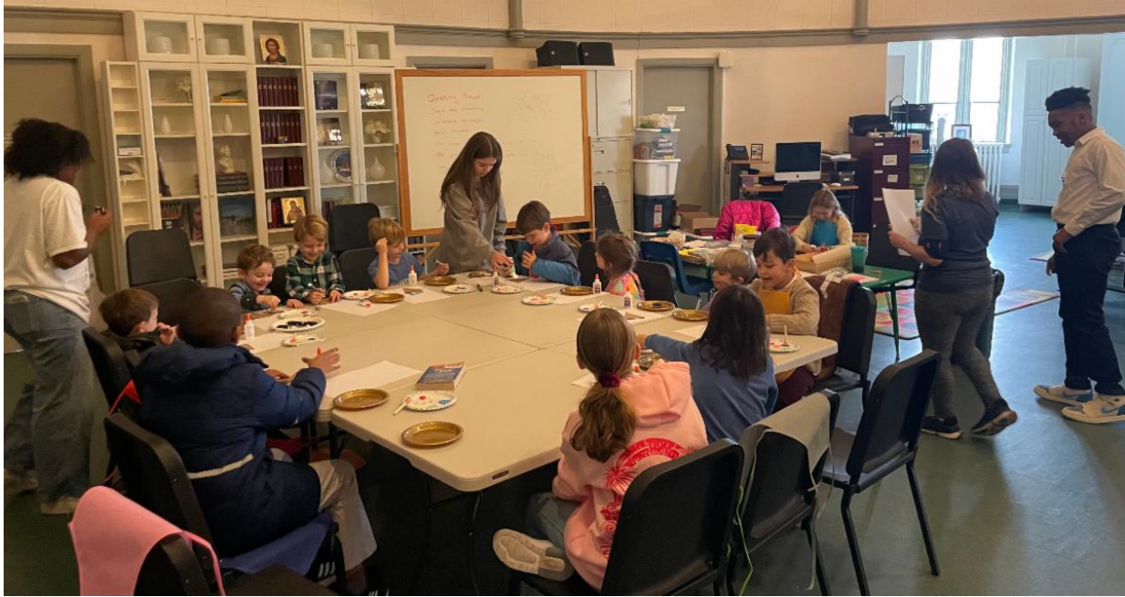
Our Annual Meeting after worship on Sunday...