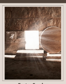
Easter Sunday March 31 6:23 a.m. 10:30 a.m. Easter Egg Hunt following 10:30 a.m. service