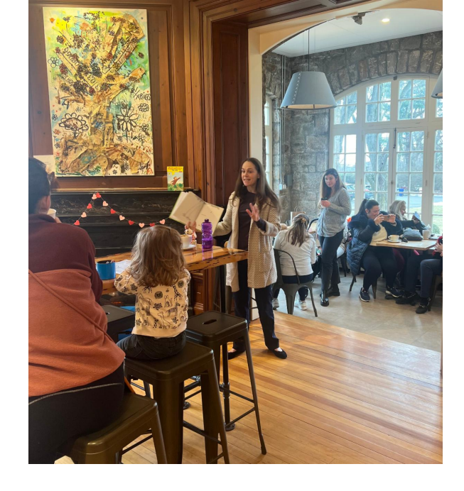
Teddy Bear Story hour was a bear blast... Our next story hour is Saturday, March 30 at 8:00 a.m. with a special bunny guest!