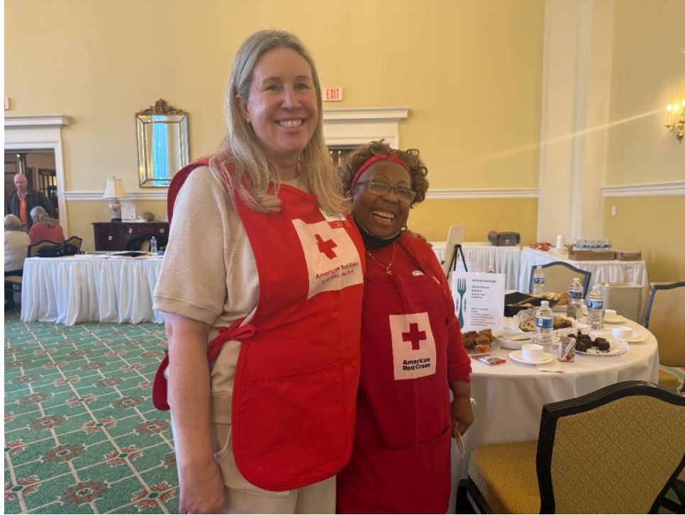
Another successful Vacation Bible School yesterday...