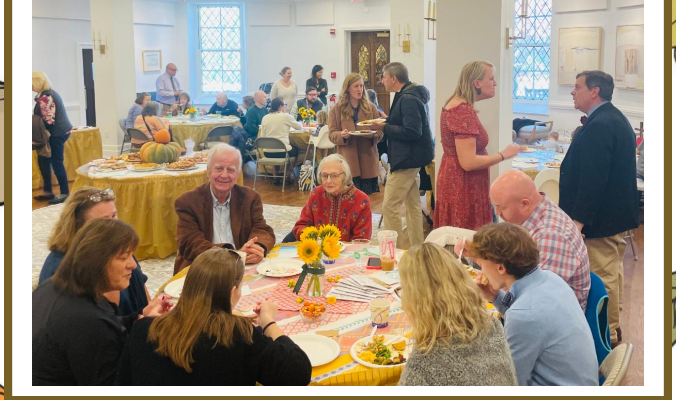
It was another great day in Children's Chapel!