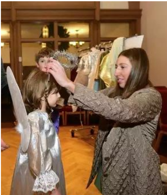
Click here to see the Greenwich Time Article from Christmas Eve