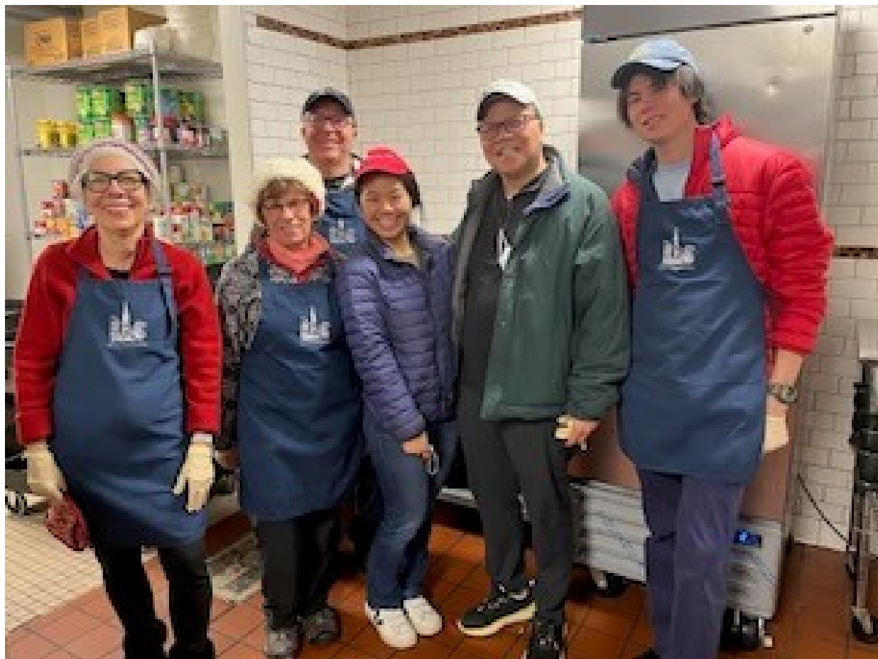
Monday's serving team at Pacific House

May they remain warm and safe during this holiday season and beyond.