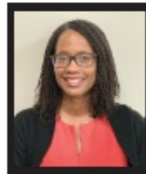
Demetria Nelson Commissioner, Greenwich Department of Human Services